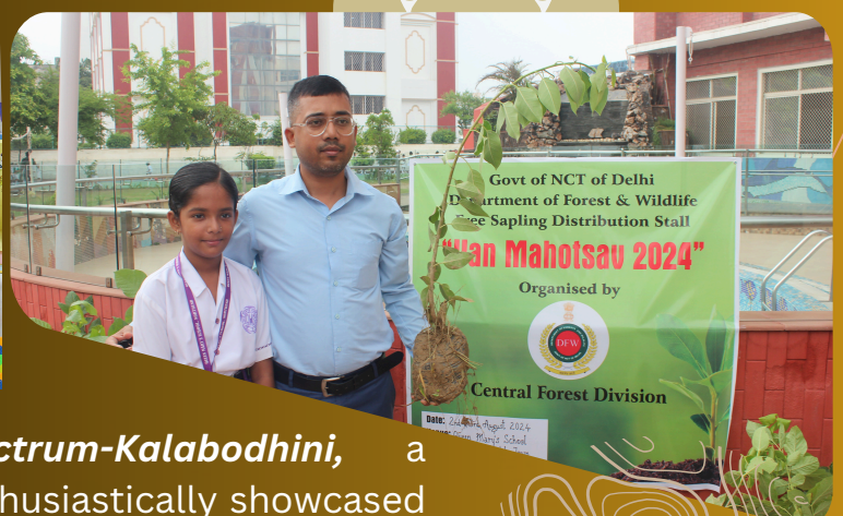
Queen Mary's School organized Spectrum-Kalabodhini , a multidisciplinary exhibition where students enthusiastically showcased their creative and artistic expressions in the school auditorium. Alongside, a Creation Care Drive was held, distributing saplings to the parents promoting environmental awareness and responsibility.